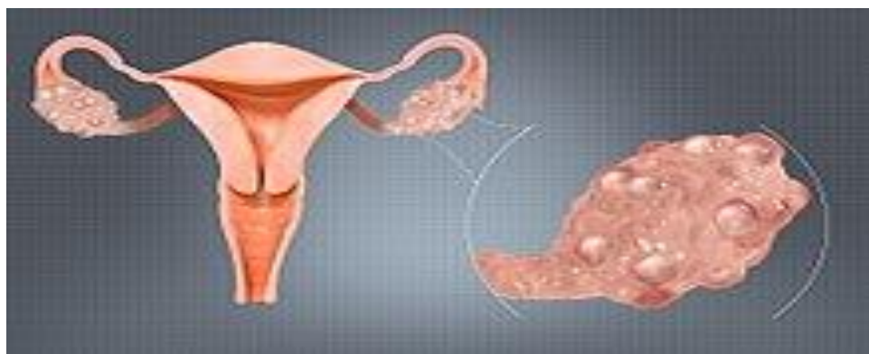
Fig.2 Pathogenesis of PCOS

Polycystic ovaries develop when the ovaries are stimulated to produce excessive amounts of androgenic hormones, in particular testosterone, by either one or a combination of the following (almost certainly combined with genetic susceptibility [27]. The release of excessive luteinizing hormone (LH) by the anterior pituitary gland through high levels of insulin in the blood (hyper-insulinemic) in women whose ovaries are sensitive to this stimulus.