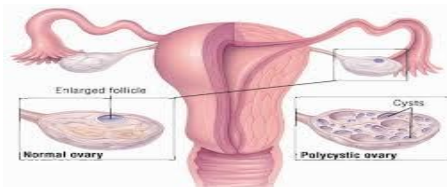
Fig.1 Female Reproductive system showing polycystic ovaries